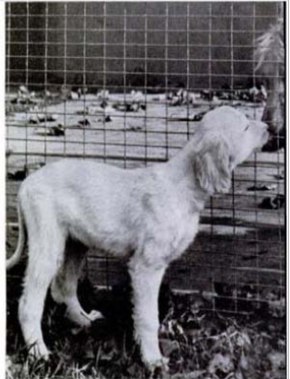
A THREE-MONTH-OLD AFGHAN PUPPY GETS ACQUAINTED WITH GROWN