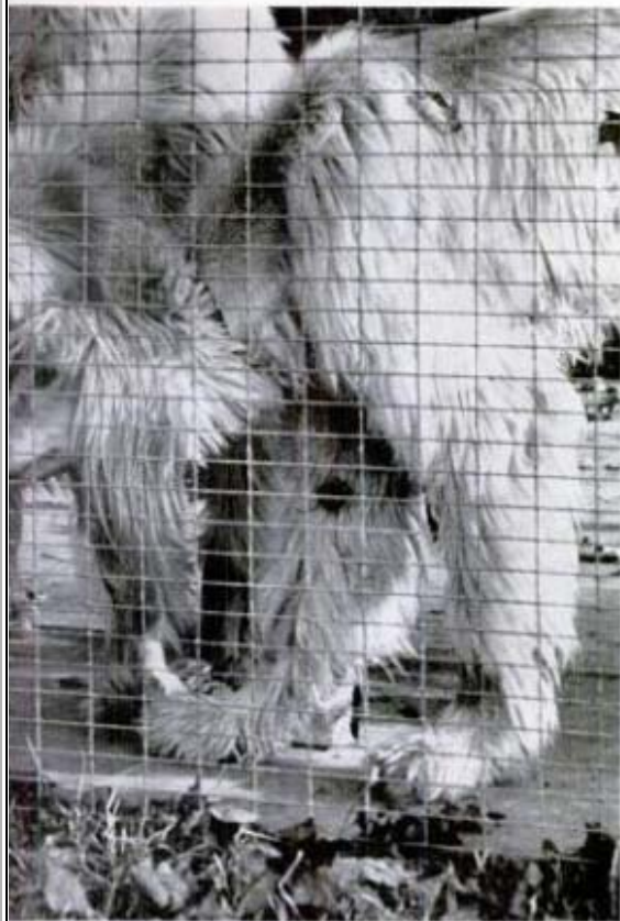
AFGHANS. ITS LONG HAIR WILL START TO GROW IN ANOTHER MONTH