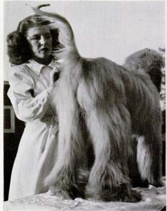
Afghan's hindquarters are covered with long hair and look somewhat like a monkey's hindquarters. Pedigreed Afghan puppies for pets cost from $100 to $250. Show puppies sell from $300 to $1,500, slightly higher than for other pedigreed dogs.