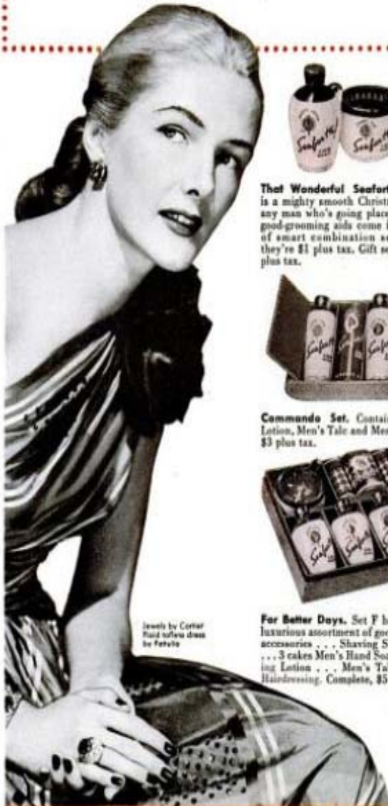
Insult by Corral Hair softens dress by Fatshe

Because he's always brushed and curried . . . because of the knot of his tie and the crease of his trousers, and the way he cocks his head when I've spent hours having a hairdo. And that air he has, suggestive of outdoors and heather. So it's a Seaforth combination set for Bob . . . I know my man.