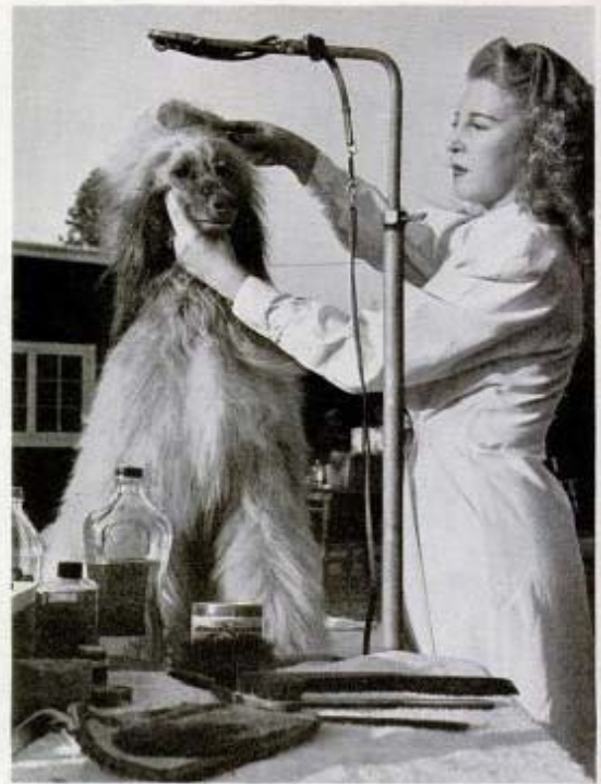
Shew-dog grooming has to be done every day. A good Afghan has a narrow, powerful head set on a long neck. His body should be strong and the hair on his head should be combed into a topknot. As a pet, the Afghan is at home in city or country.