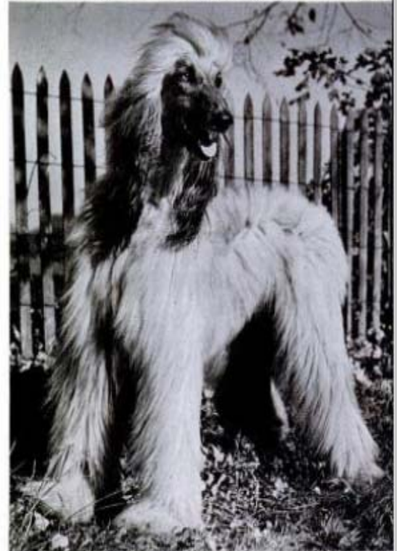
Champion Afghan Rudiki stands ready for a dog show, groomed so that every hair is in place. An Afghan's coat is very soft and silky and needs brushing at least three times a week. The Afghan hound is a pure breed and not related to any other dog.